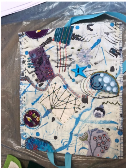
Hand-dyed and embroidered fabric made into a note-book cover