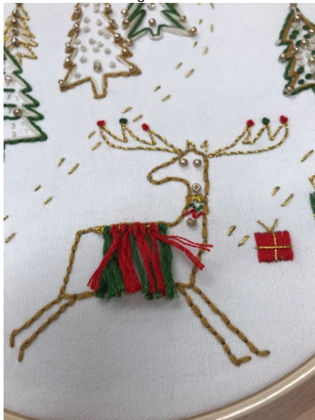
Learning how to stitch