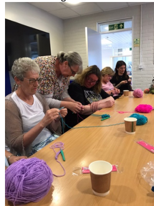
Learning how to crochet