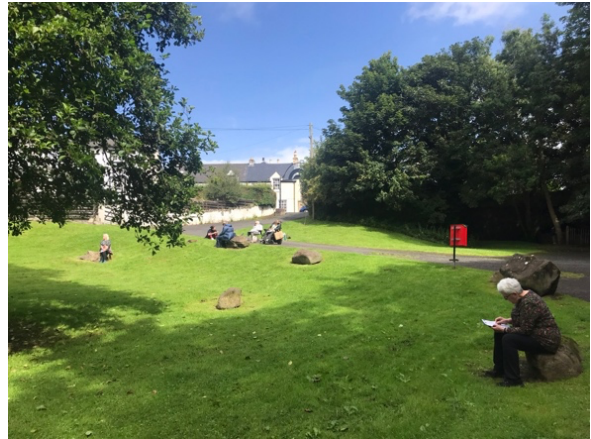
Mindfully drawing in nature